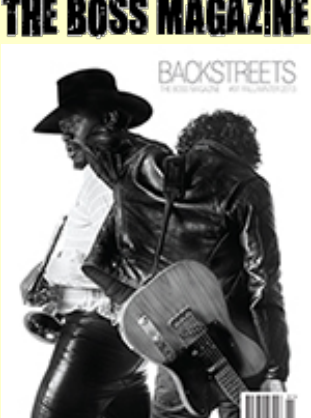
Our massive new issue honors a very Big Man. More than half of the 116page, perfect bound Backstreets #91 is a tribute to the life and music of... do we have to