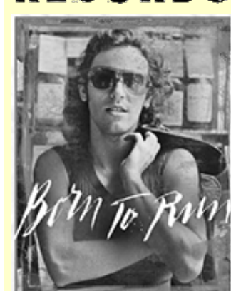
OFFICIAL BORN TO RUN SHIRTS Celebrate 40 years! All